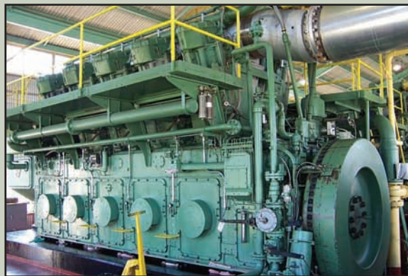
Before: Gas engine rated at 2,400 hp and 250 rpm (unit characterized as having high emissions of NOx and relatively poor fuel efficiency).